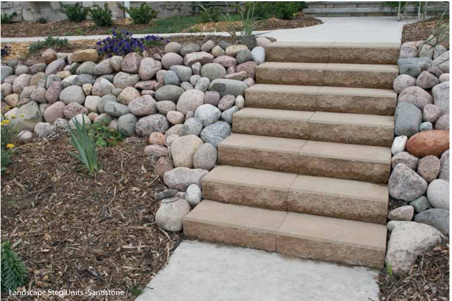
Landscape Step Units - Sandstone