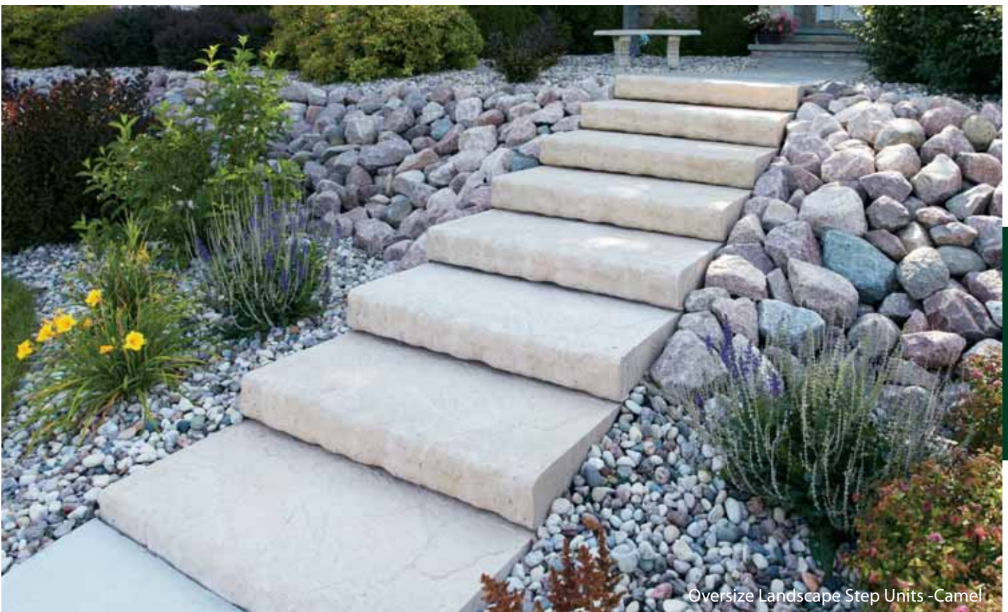
Oversize Landscape Step Units - Camel