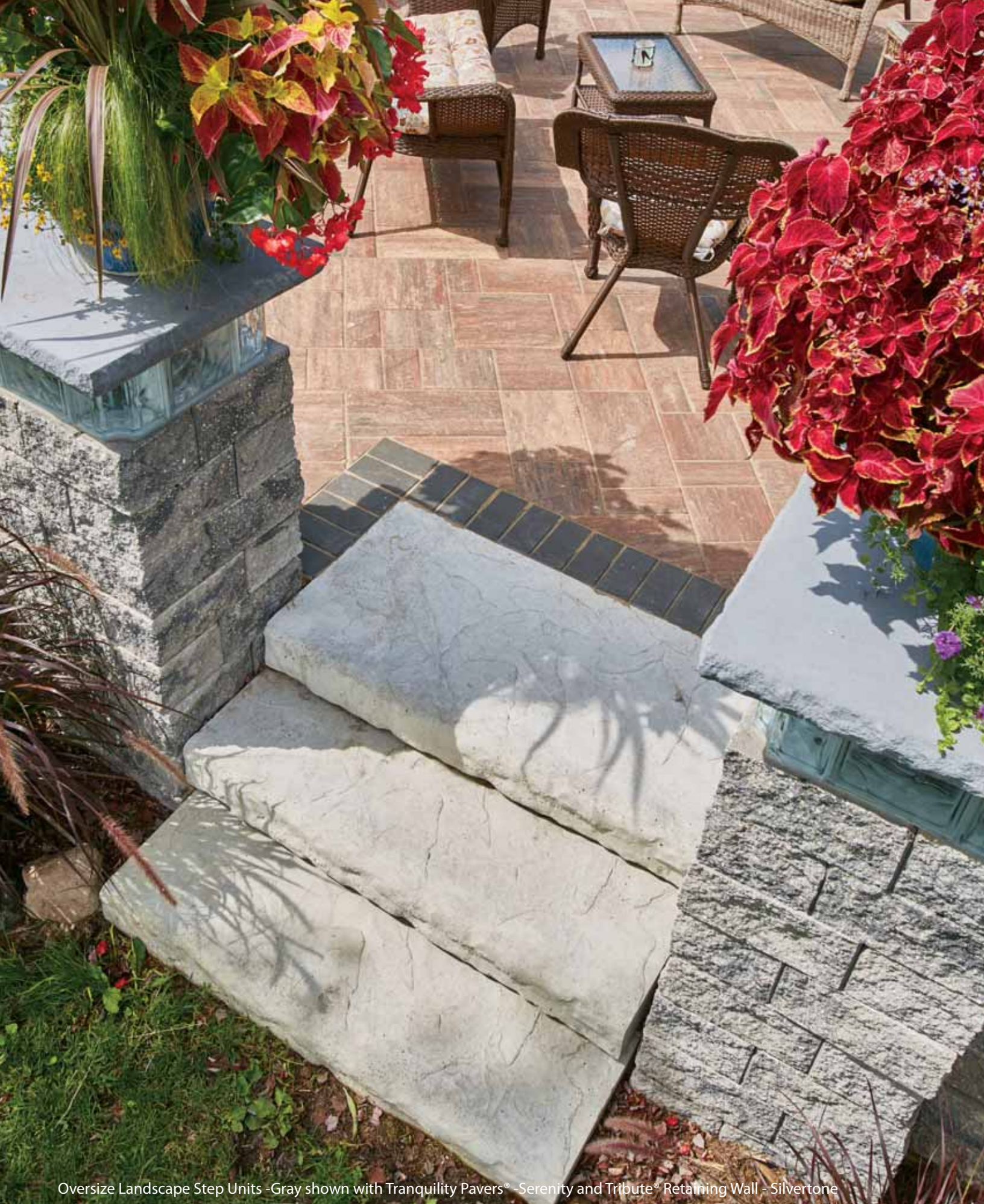
Oversize Landscape Step Units -Gray shown with Tranquility Pavers® -Serenity and Tribute® Retaining Wall - Silvertone