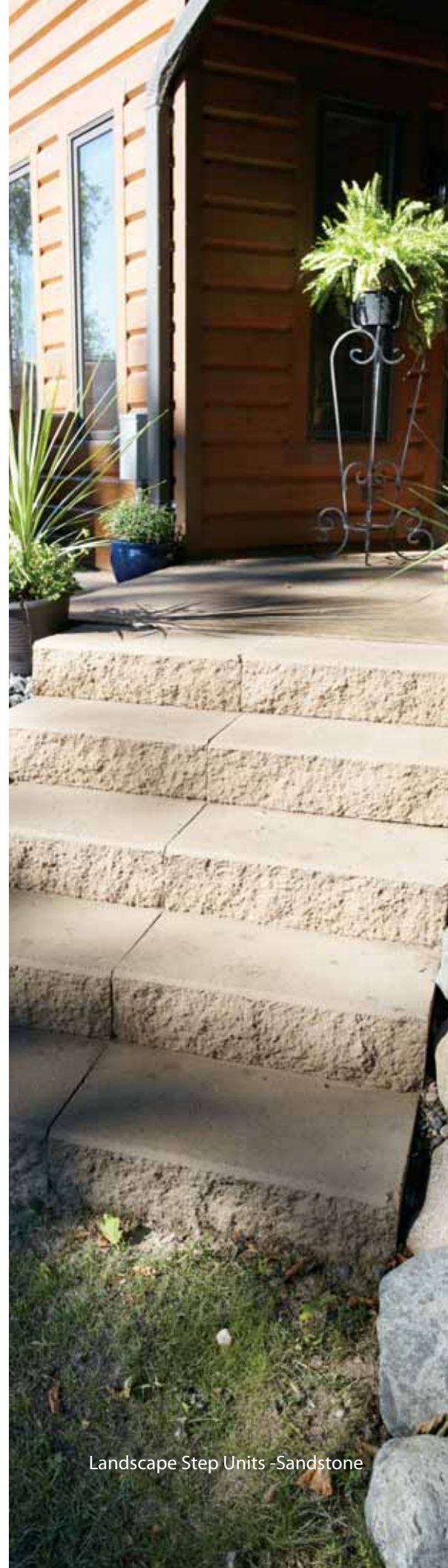
Landscape Step Units -Sandstone