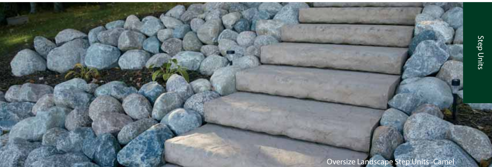
Oversize Landscape Step Units - Camel