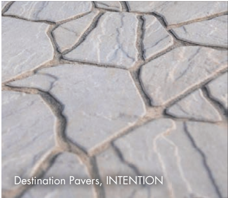
Destination Pavers, INTENTION

Destination® Pavers are offered in nine sizes that fit together seamlessly and afford unlimited design freedom. This versatility allows for simple or dramatic combinations that blend well with other paver accents to become the quintessential focal point of any property.