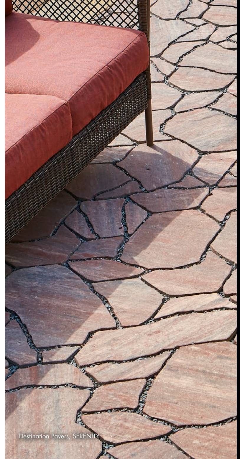
Destination Pavers, SERENITY

All individual pieces measure 2 3 / 4 (70mm) High. D & L vary.