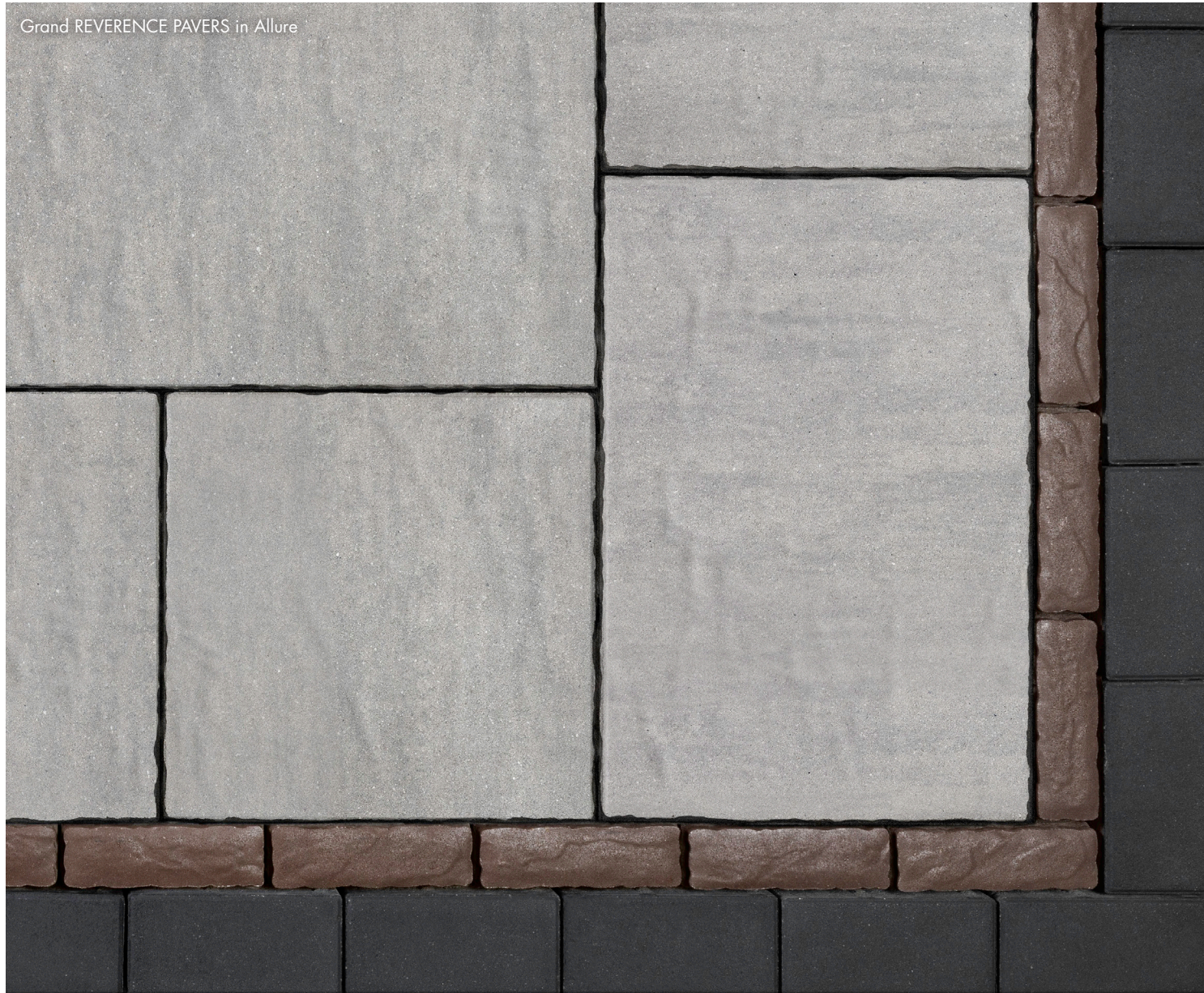
Grand REVERENCE PAVERS in Allure