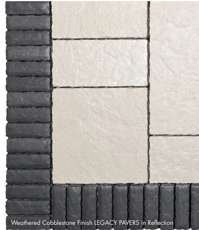
Weathered Cobblestone Finish LEGACY PAVERS in Reflection