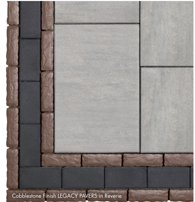
Cobblestone Finish LEGACY PAVERS in Reverie