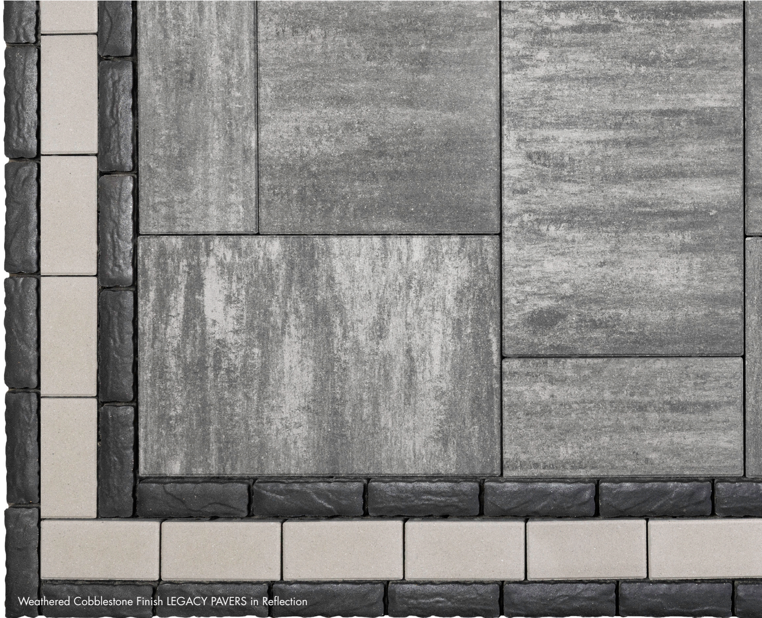
Weathered Cobblestone Finish LEGACY PAVERS in Reflection