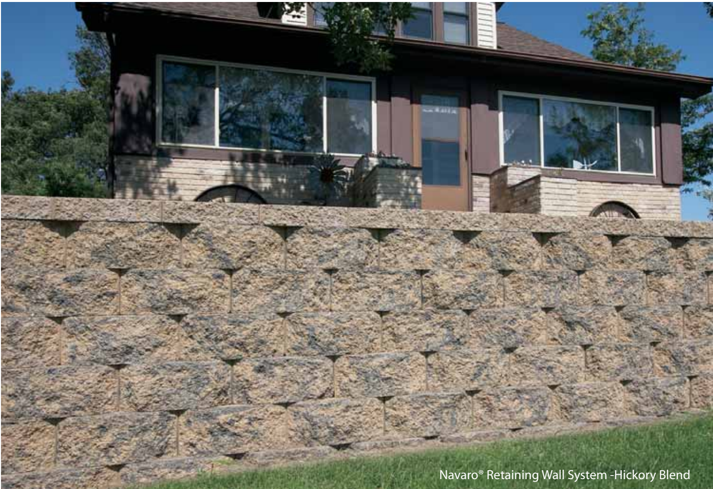
Navaro® Retaining Wall System -Hickory Blend