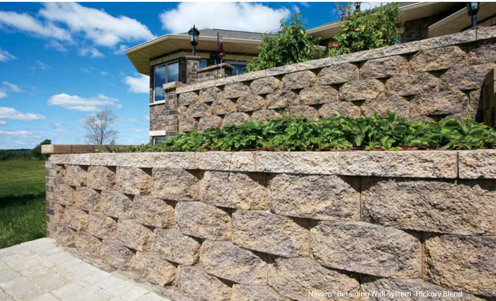
Navaro ® Retaining Wall System - Hickory Blend