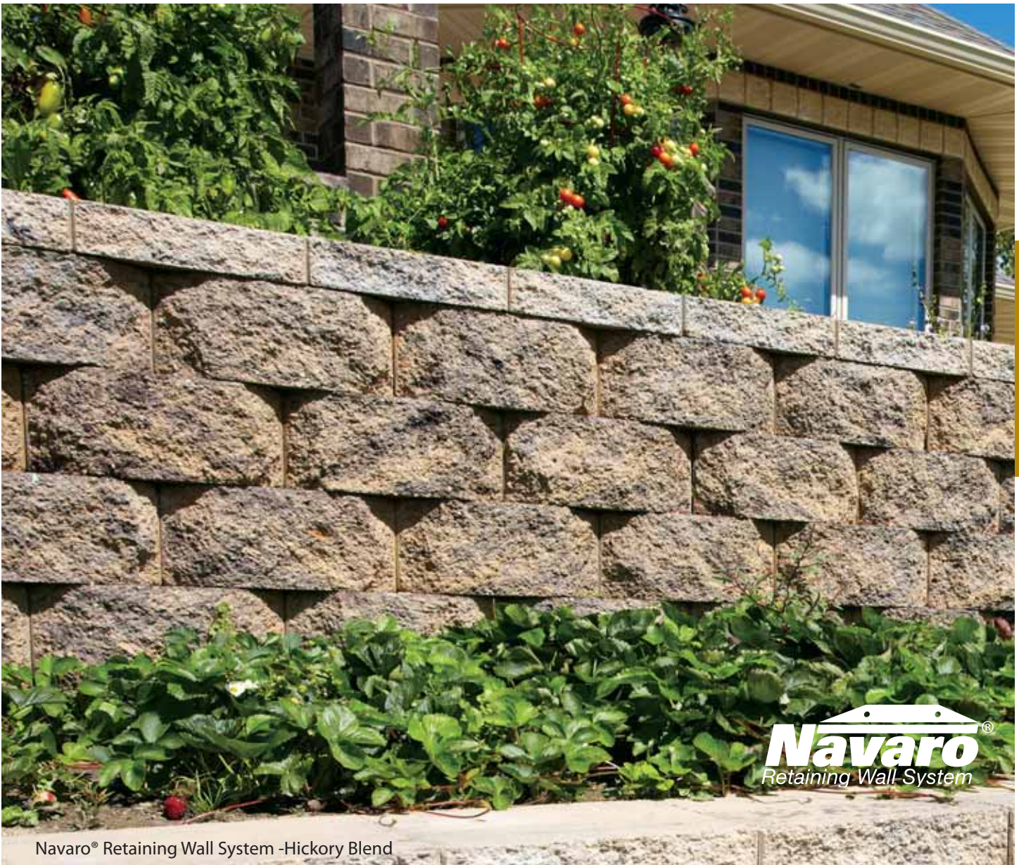
Navaro® Retaining Wall System -Hickory Blend