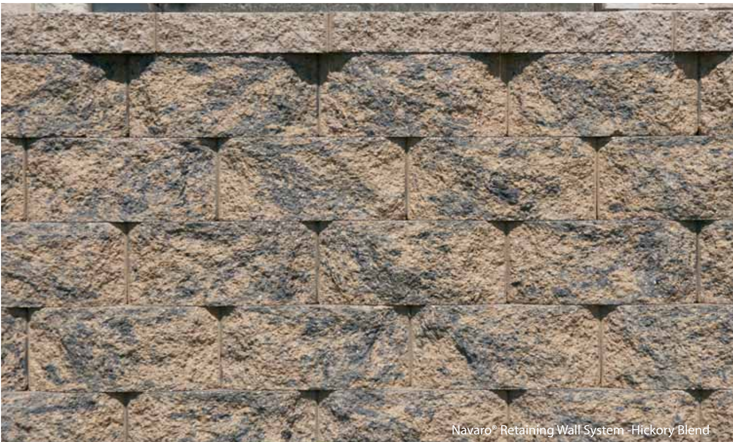
Navaro® Retaining Wall System -Hickory Blend