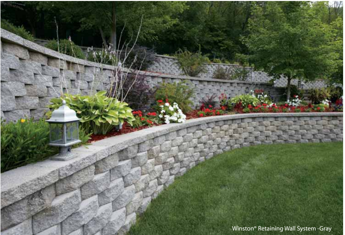
Winston® Retaining Wall System -Gray