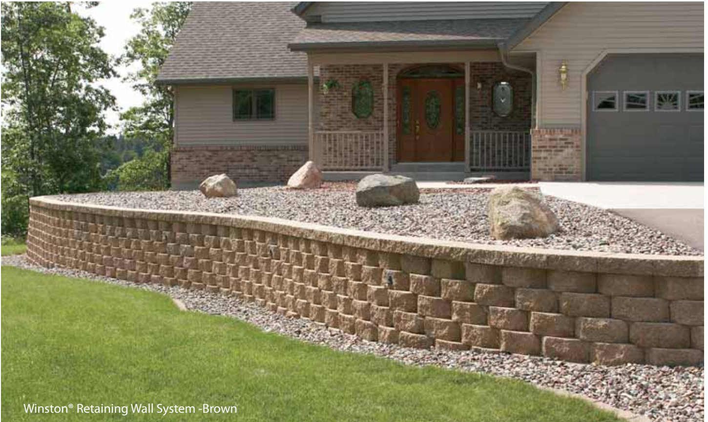
Winston® Retaining Wall System -Brown