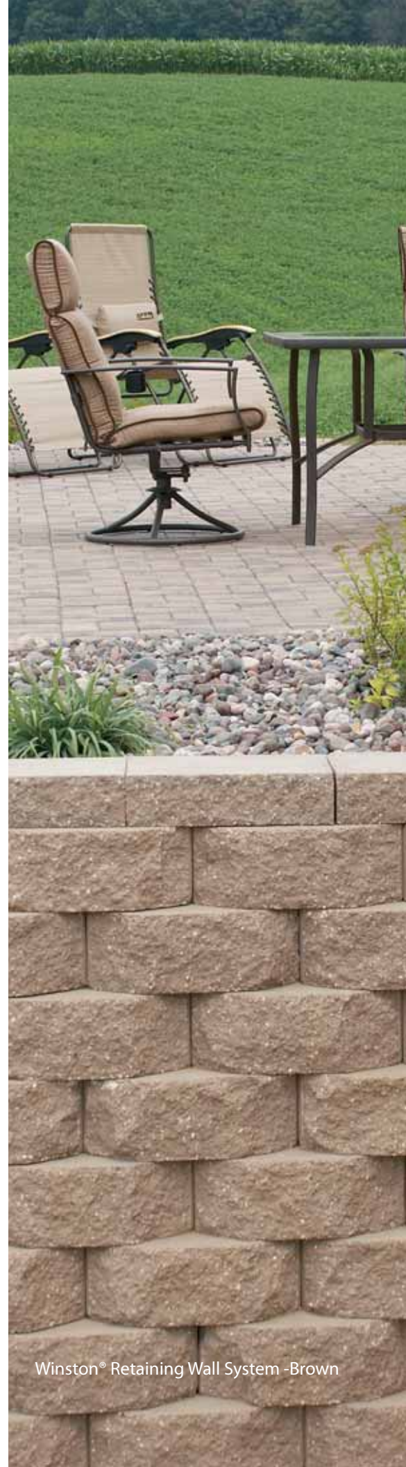
Winston ® Retaining Wall System -Brown

Note: Only available in select markets. Contact your County Materials' representative for details.