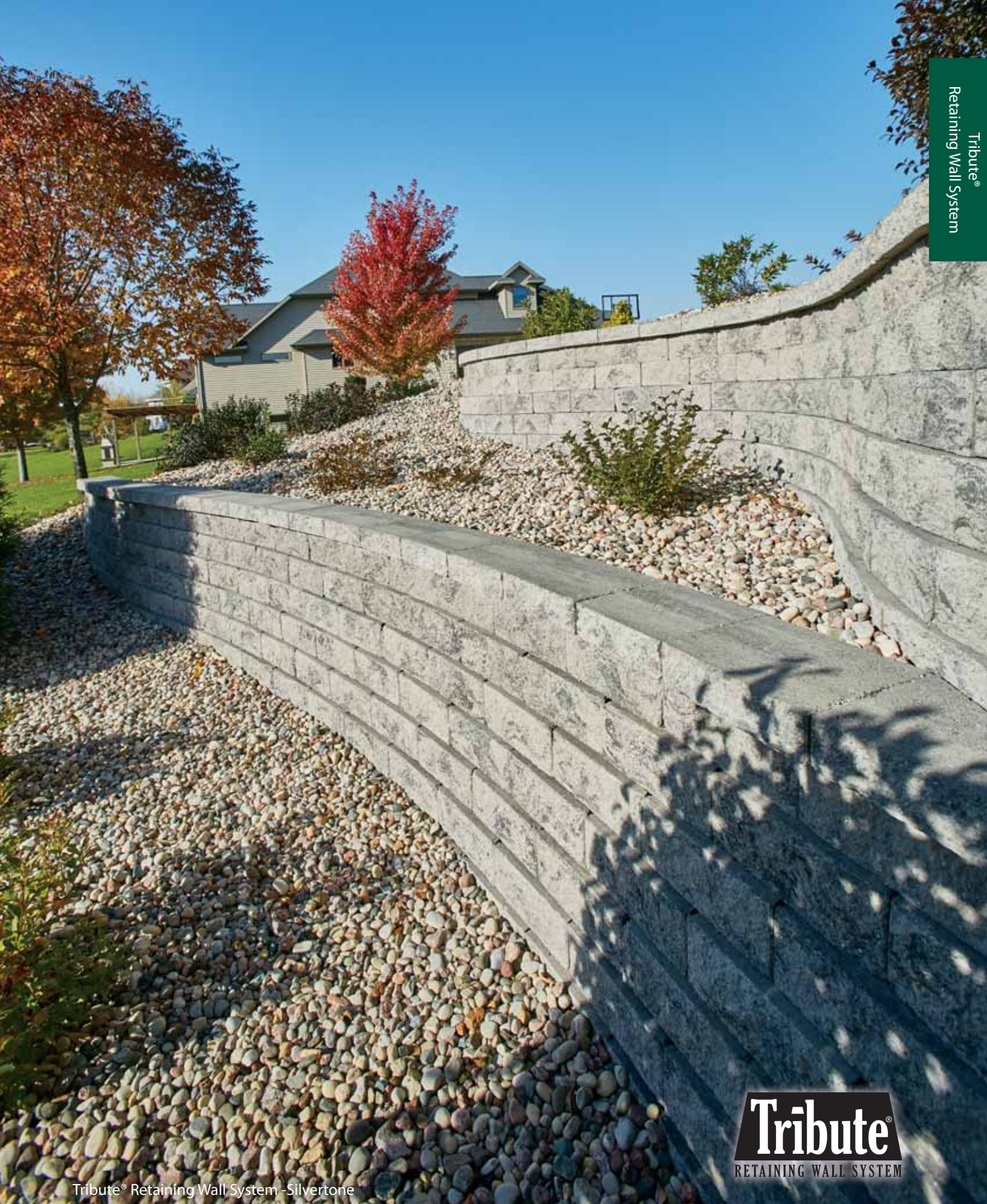
Tribute® Retaining Wall System -Silvertone