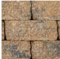
Hickory Blend- Rustic