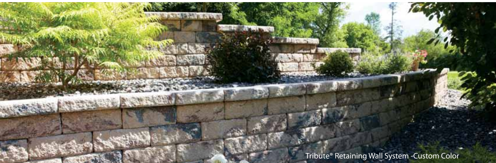
Tribute ® Retaining Wall System -Custom Color