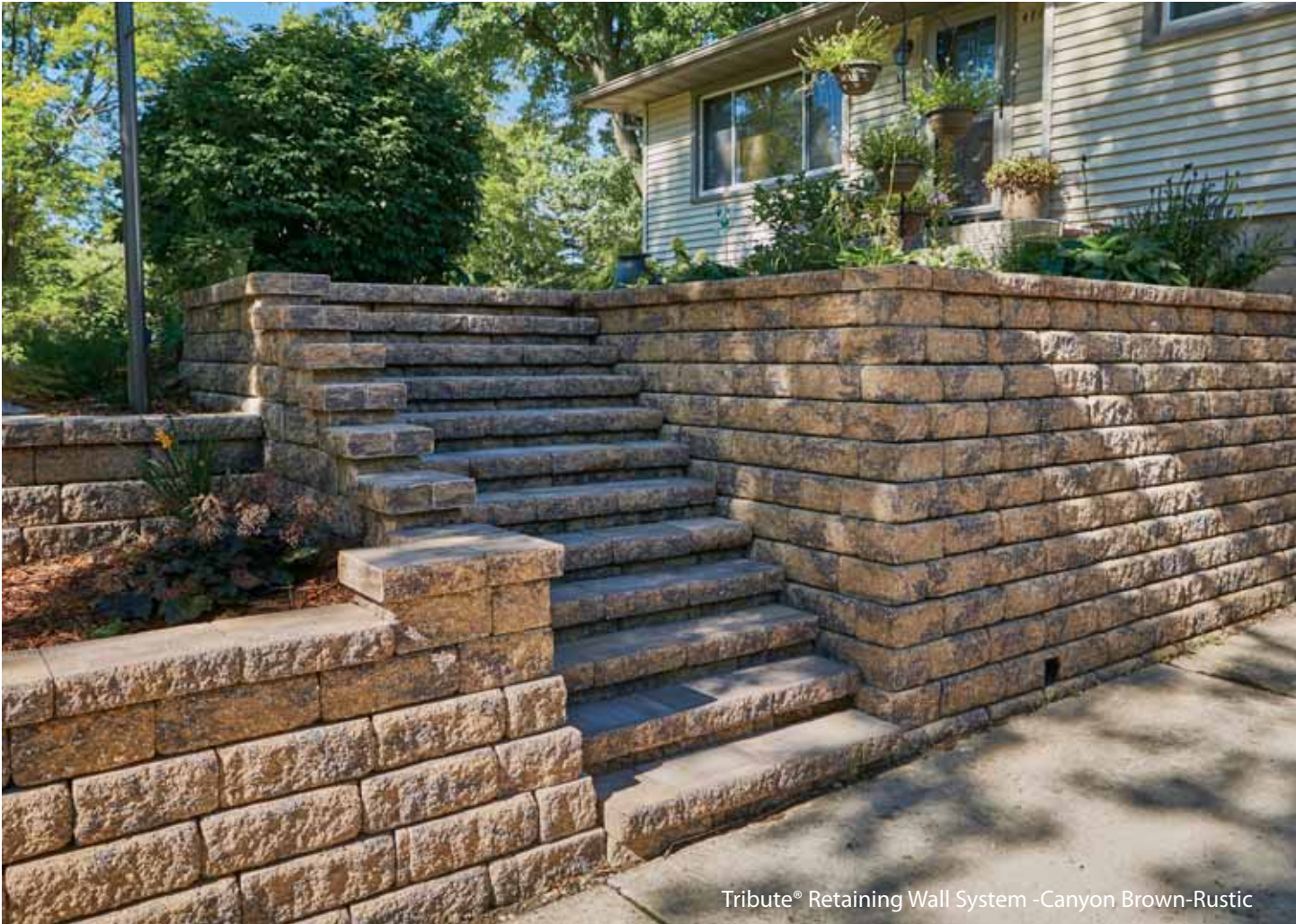
Tribute® Retaining Wall System -Canyon Brown-Rustic