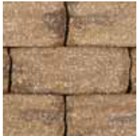
Canyon Brown- Rustic