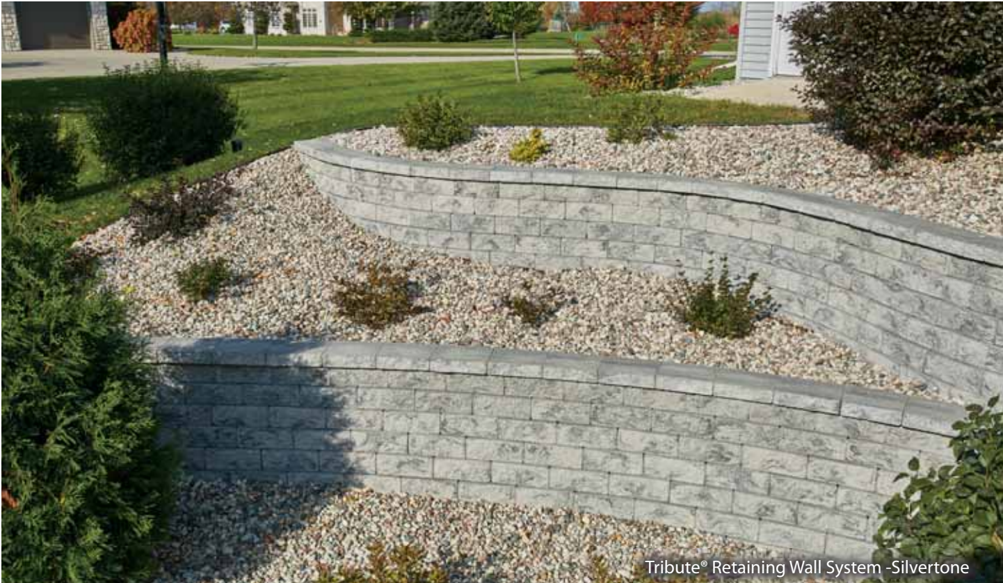
Tribute® Retaining Wall System -Silverstone