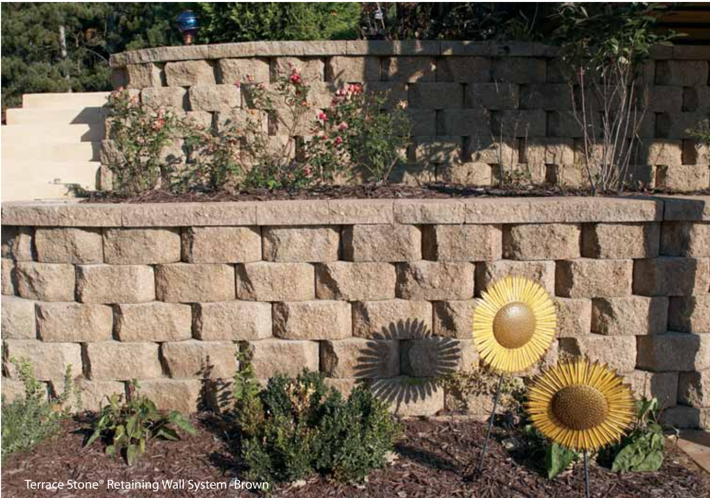
Terrace Stone® Retaining Wall System -Brown