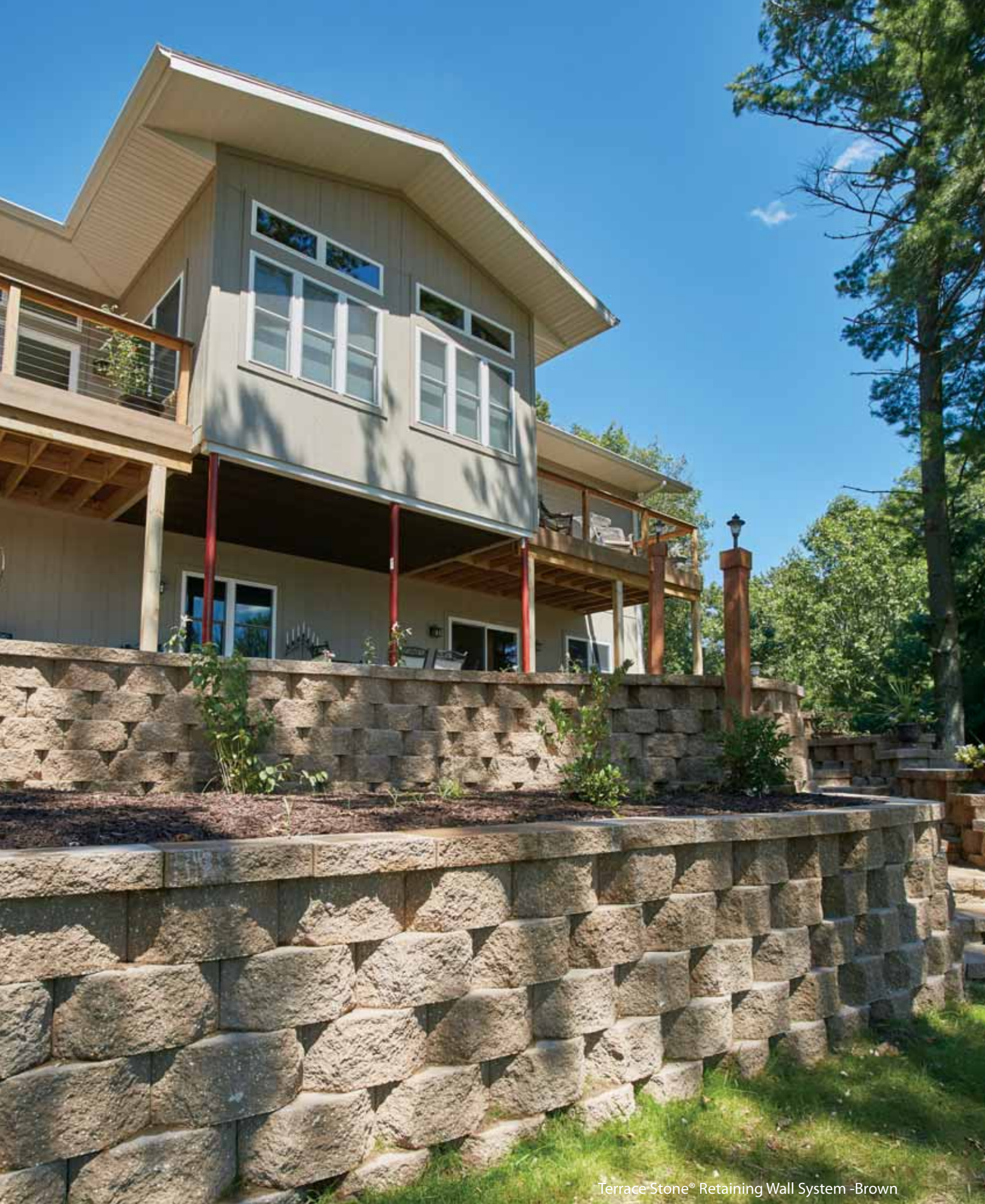
Terrace Stone® Retaining Wall System -Brown