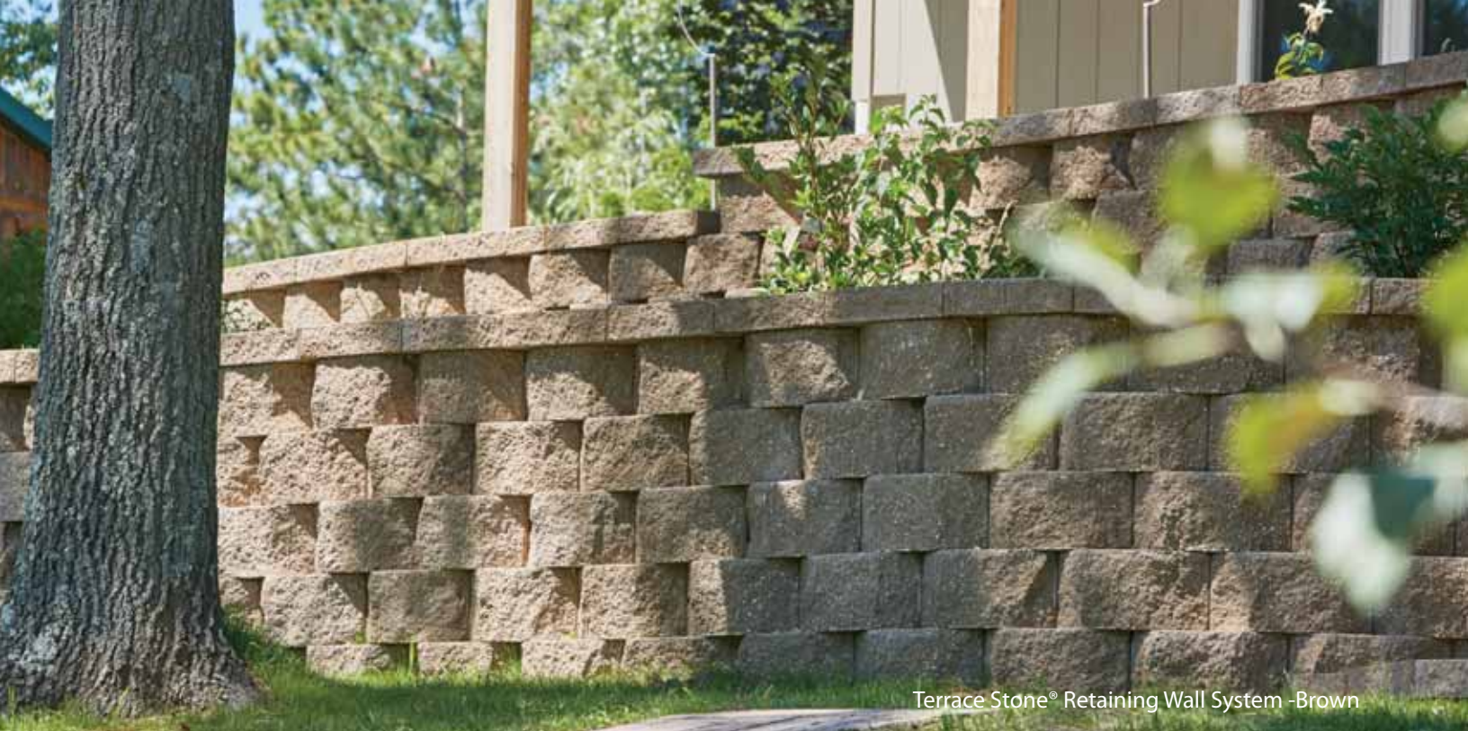
Terrace Stone® Retaining Wall System -Brown