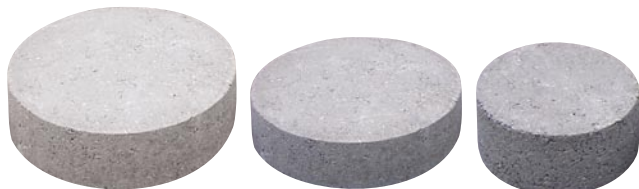
Pole Pads 14", 12", 8" Diameter x 3 5/8" Deep

'Practically' perfect; gain a foothold with County Materials' pole pads