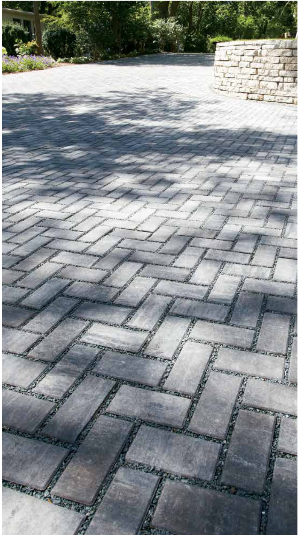
Rejuvenate Permeable Pavers – MAJESTIC color

The color photos shown in this catalog were prepared with careful attention to accuracy. However, colors shown may vary from actual hues and should only be used as a guide. Refer to actual product samples for final color selection. Because concrete units are manufactured with high quality, naturally-mined aggregates and materials, variations in color or shading should be expected in products that are manufactured at different times and in units having different shapes. This color or shading variation is acceptable in the industry.