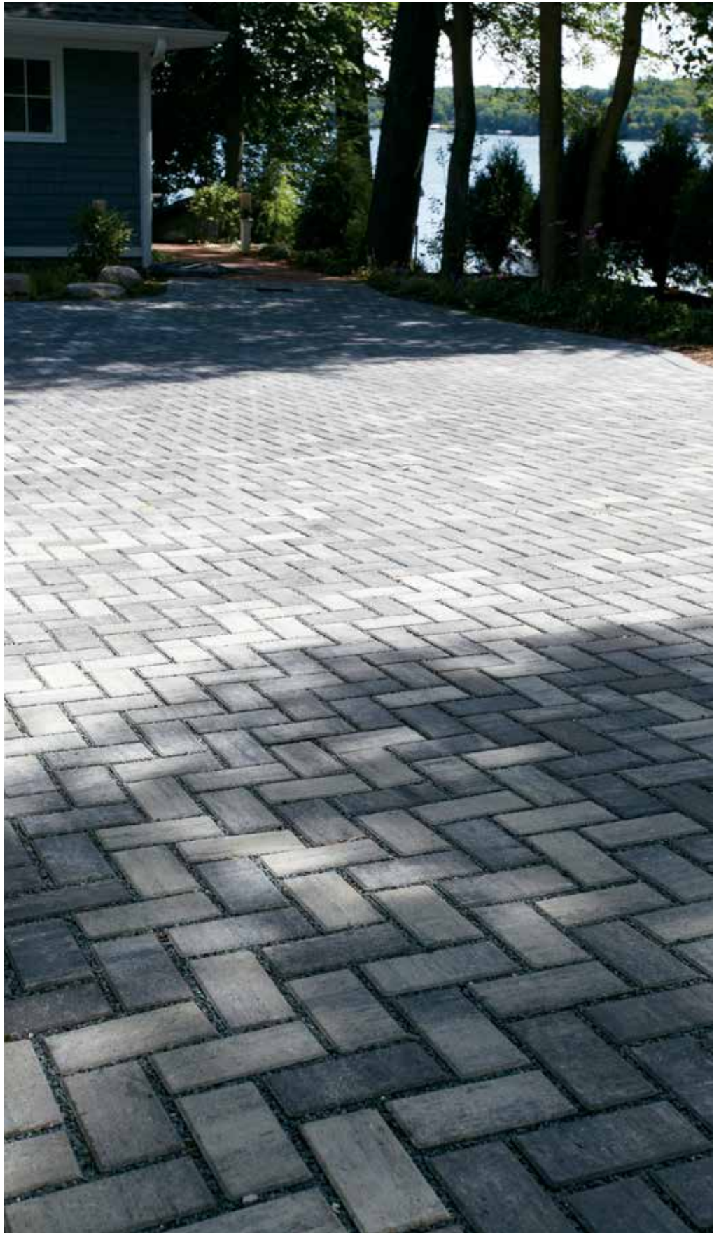
Rejuvenate Permeable Pavers – MAJESTIC color

©2021 County Materials Corporation • 0221