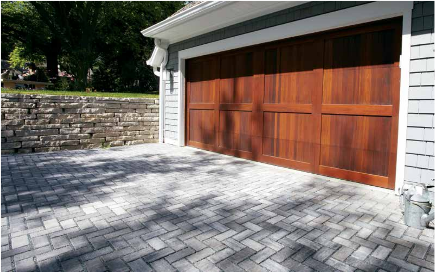
Rejuvenate Permeable Pavers – MAJESTIC color