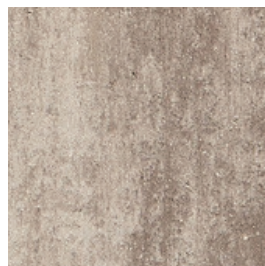
Enlighten - NEW