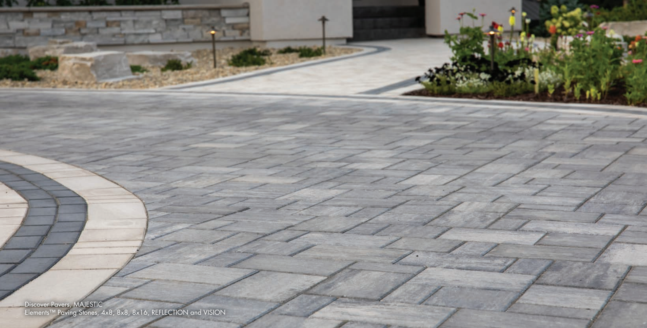
Discover Pavers, MAJESTIC Elements™ Paving Stones, 4x8, 8x8, 8x16, REFLECTION and VISION