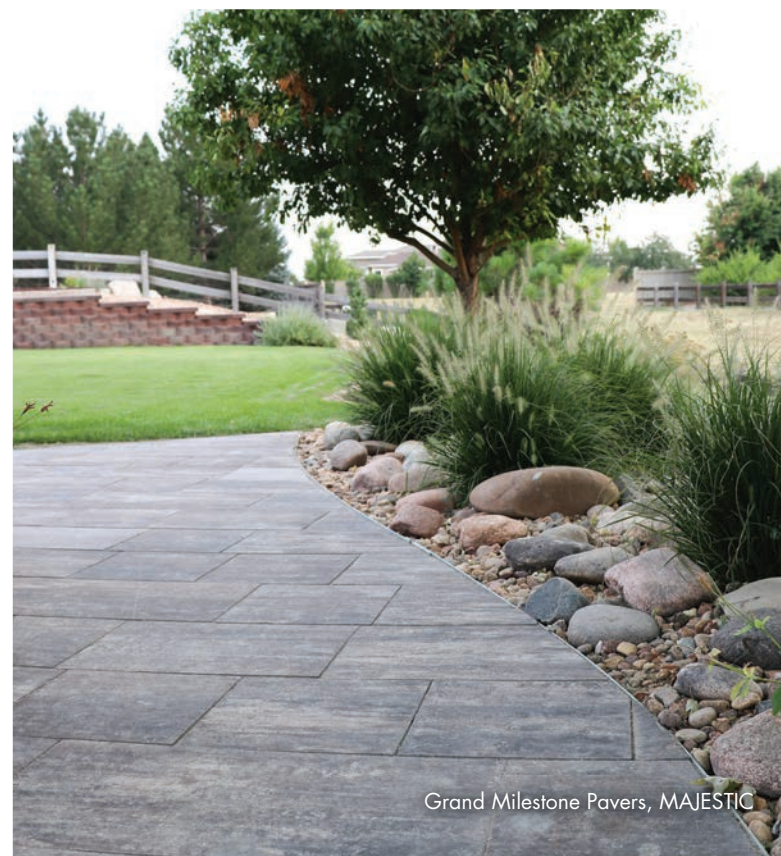
Grand Milestone Pavers, MAJESTIC