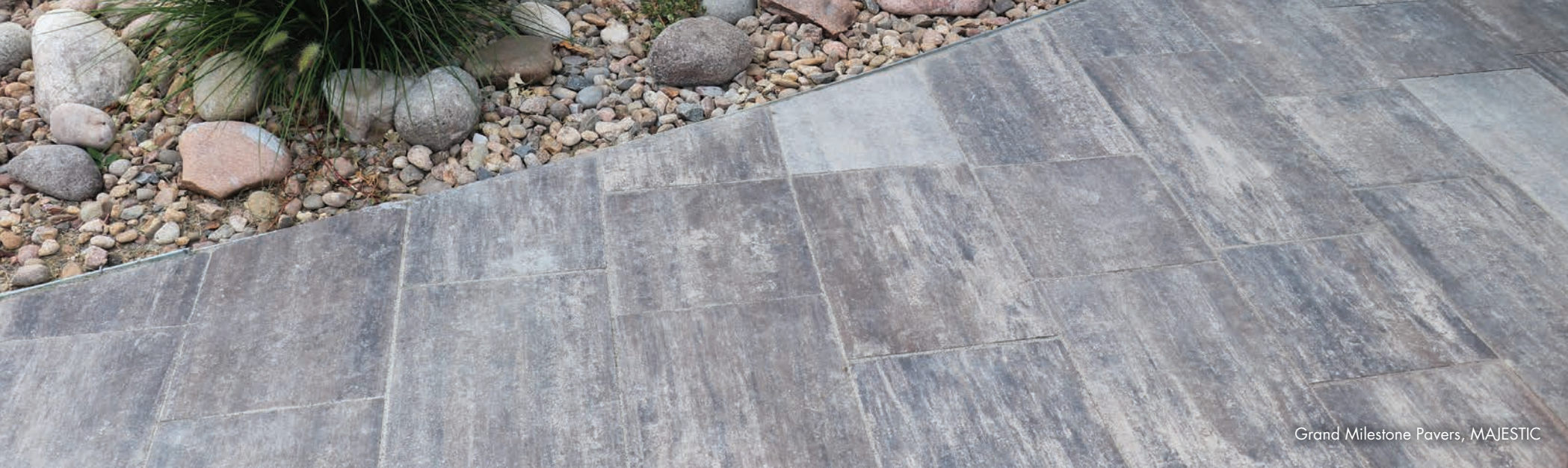
Grand Milestone Pavers, MAJESTIC