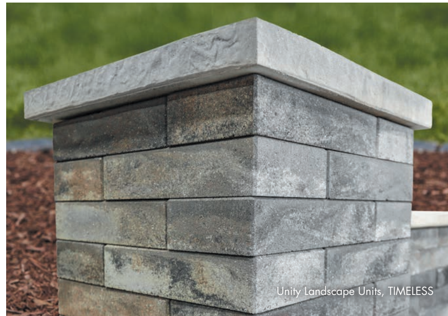
Unity Landscape Units, TIMELESS