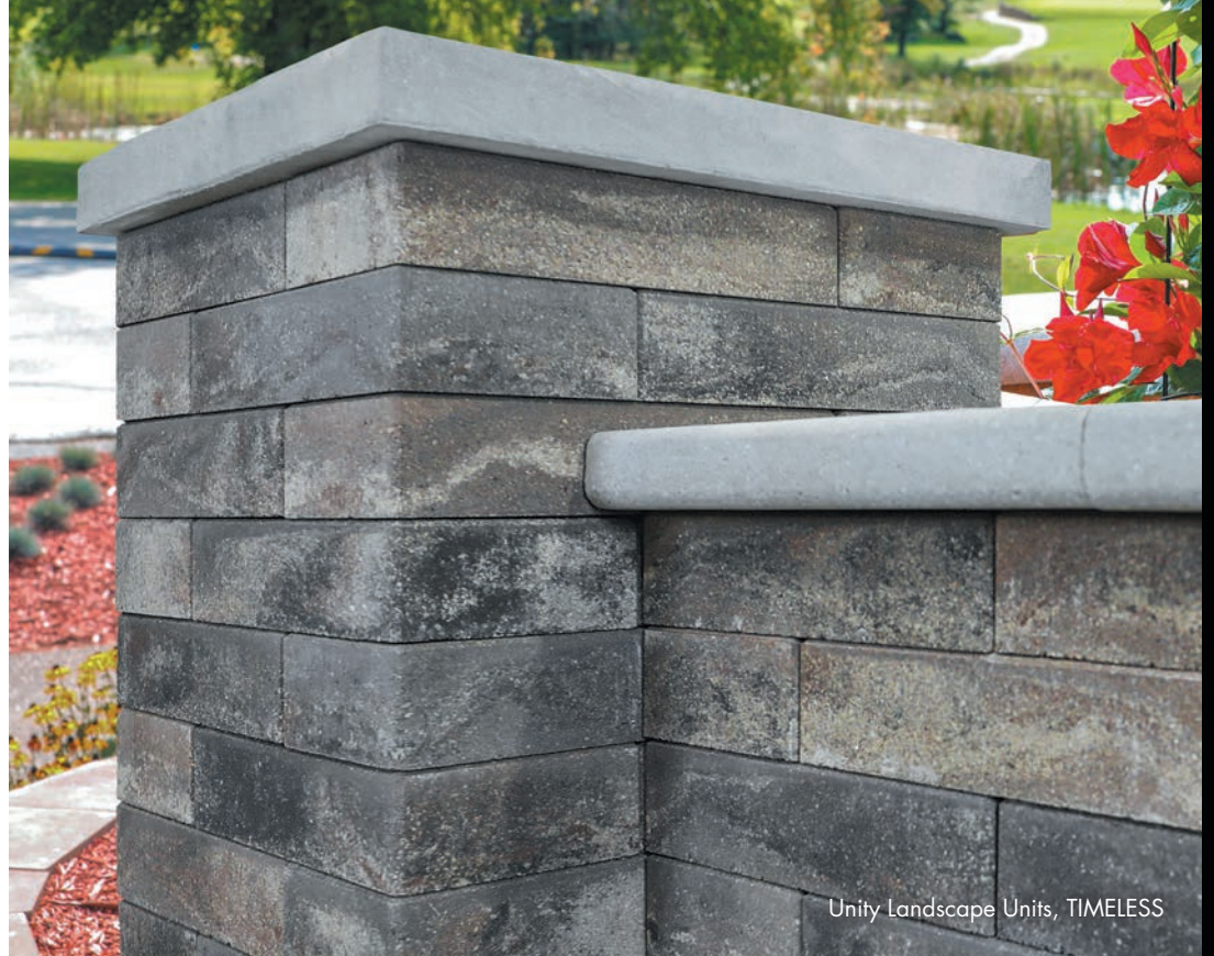
Unity Landscape Units, TIMELESS

Rectangular – 9 x 18 x 4 (4 sides finish)