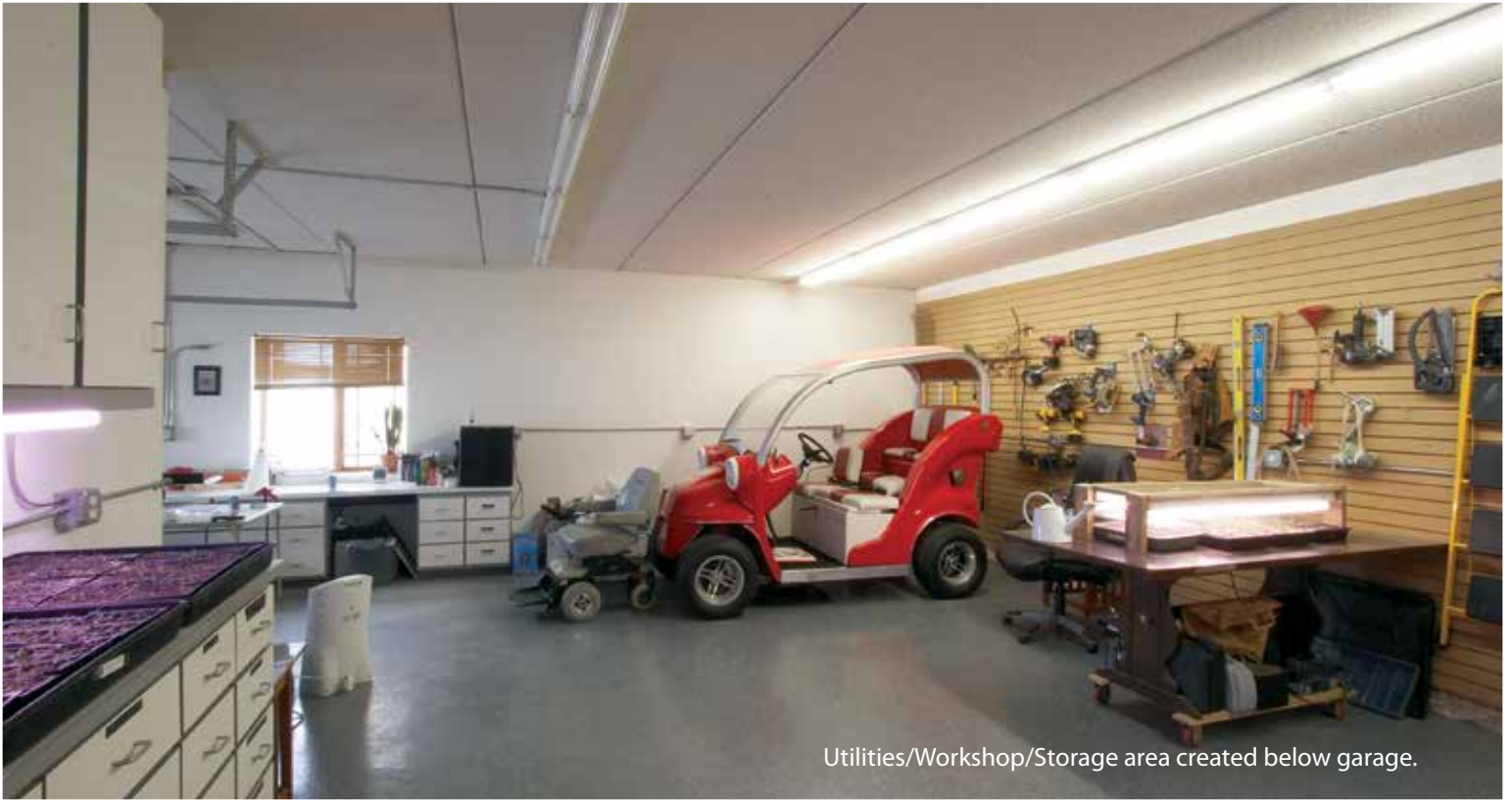
Utilities/Workshop/Storage area created below garage.