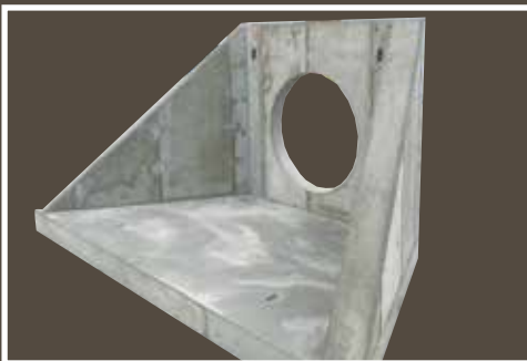
Precast Pipe Headwall