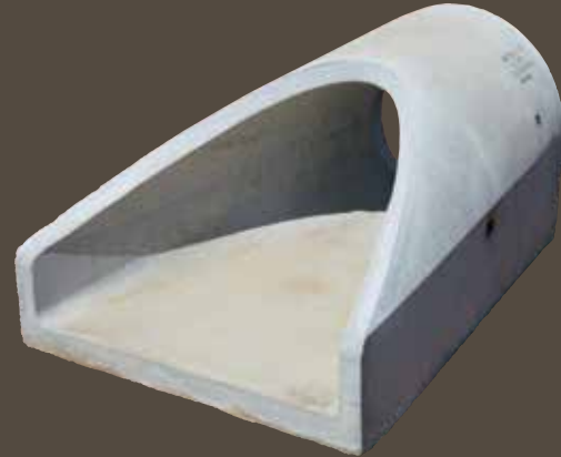
Flared End Sections

All material meets AASHTO & ASTM specifications. Material meets requirements for INDOT