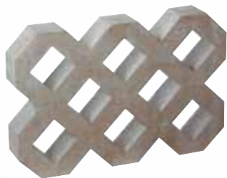
Grass Paver 16" D x 3 5/8" H x 24" L

County Materials' permeable Grass Paver prevents erosion by stabilizing the soil while keeping an eye on your budget ... and the environment.